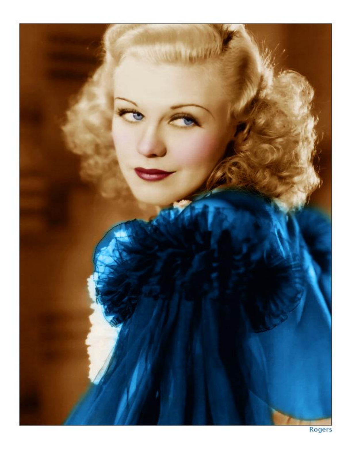
Appendix 04: Ginger Rogers